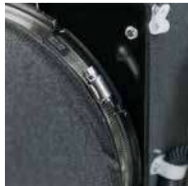
The Gold air handler's HV blower can be easily rotated in the field by loosening the single adjustment screw on the blower collar (standard AU model shown).