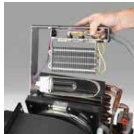
The assembly for the optional electric heater (top) and Breathe Easy air purifier (bottom) fits between the coil and blower (standard AU model shown).