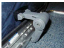
Lid Profile- Mk 1&2